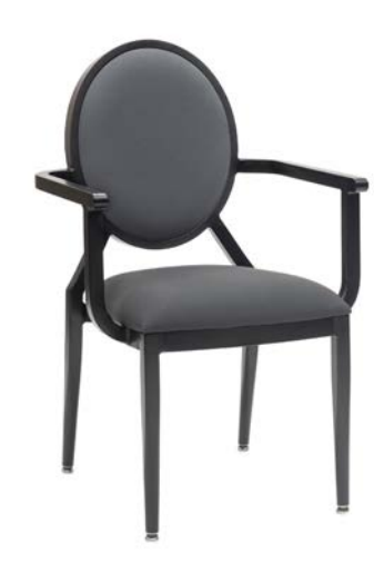
ELE-100-A Stackable Arm Chair

Seat Height: 19.0 in Seat Width: 17.5 in Seat Depth: 19.5 in Overall Height: 36.3 in Overall Width: 17.6 in Overall Depth: 23.3 in