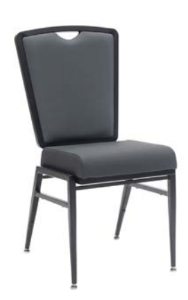
IDO-104 Stack Chair

Seat Height: 19.0 in | Seat Width: 15.5 in Seat Depth: 17.8 in | Overall Height: 35.0 in Overall Width: 17.5 in | Overall Depth: 23.5 in