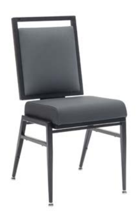
IDO-102 Stack Chair