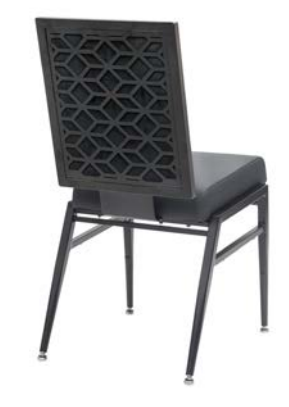
IDO-103 Stack Chair with Lattice Back

Seat Height: 19.0 in | Seat Width: 15.5 in Seat Depth: 17.8 in | Overall Height: 35.0 in Overall Width: 17.5 in | Overall Depth: 23.5 in