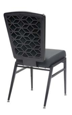
IDO-105 Stack Chair with Lattice Back

Seat Height: 19.0 in | Seat Width: 15.5 in Seat Depth: 17.8 in | Overall Height: 35.0 in Overall Width: 17.9 in | Overall Depth: 23.5 in