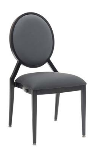
ELE-100 Stackable Side Chair