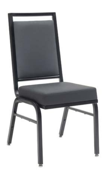
CAL-100 Stack Chair