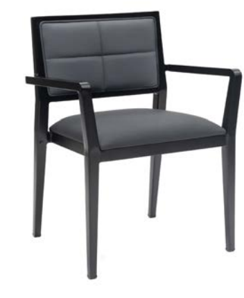
NLA-100-A Stackable Arm Chair

Seat Height: 19.0 in Seat Width: 19.7 in Seat Depth: 18.3 in Overall Height: 34.1 in Overall Width: 20.3 in Overall Depth: 20.5 in