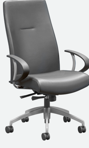
GEN-202 High Back

Seat H: 17.0-20.0 in Overall H: 37.5-40.5 in Seat W: 20.0 in; Overall W: 25.5 in Seat D: 18.5 in; Overall D: 27.0 in