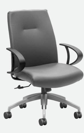
GEN-201 Mid Back

Seat H: 17.0-20.0 in Overall H: 37.5-40.5 in Seat W: 20.0 in; Overall W: 25.5 in Seat D: 18.5 in; Overall D: 27.0 in