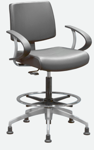
GEN-100-B Task Stool

Shown with Optional Adjustable Poly Arms