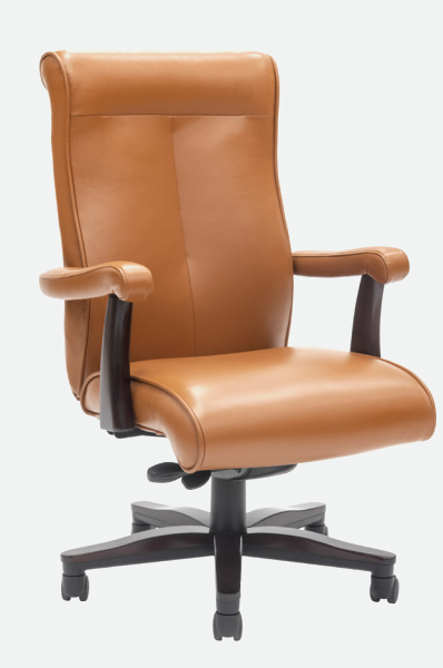
PAR-101 Mid Back

Seat H: 19.0-23.0 in; Overall H: 41.0-45.0 in Seat W: 21.0 in; Overall W: 26.5 in Seat D: 18.0 in; Overall D: 27.5 in