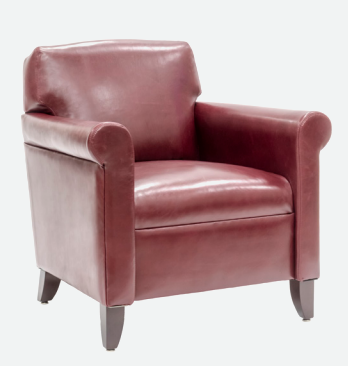
MAX-100 Armchair - Short Back

Seat H: 19.0 in; Overall H: 34.0 in Seat W: 21.5 in; Overall W: 33.0 in Seat D: 23.0 in; Overall D: 33.0 in