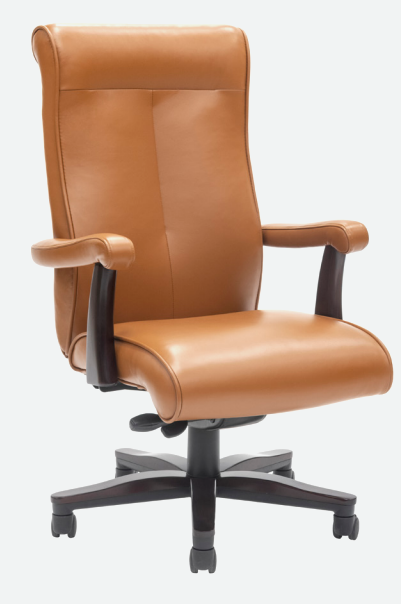
PAR-102 High Back

Seat H: 19.0-23.0 in; Overall H: 41.0-45.0 in Seat W: 21.0 in; Overall W: 26.5 in Seat D: 18.0 in; Overall D: 27.5 in