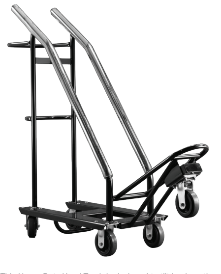
This Heavy Duty Hand Truck is designed to tilt back on the rear set of wheels in order to safely transport a stack of chairs with less effort and better efficiency. It is ideal for use when many chairs are being frequently moved.