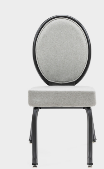
LGN-102 OVAL BACK

Seat Height: 18.5 in Seat Width: 16.5 in Seat Depth: 16.0 in Overall Height: 35.0 in Overall Width: 17.0 in Overall Depth: 22.5 in