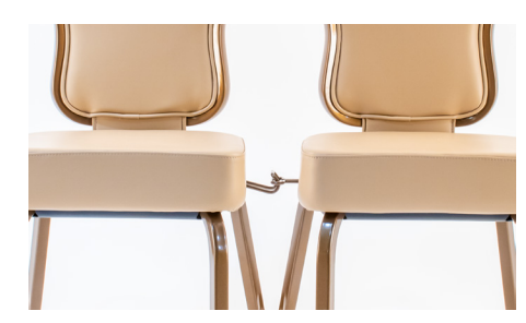
Style and design of ganging brackets may change depending on selected model. All options may not fit all models.