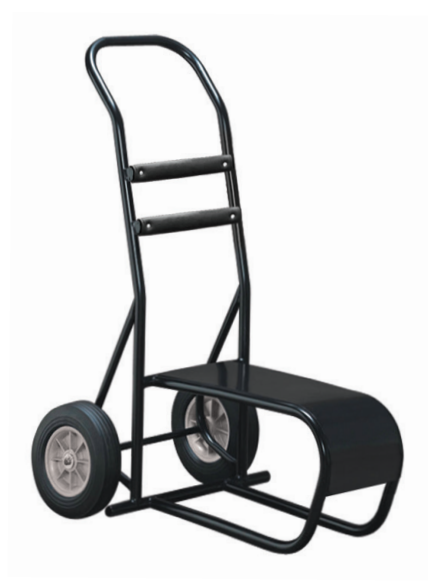
Gasser Standard Hand Trucks are constructed with a welded assembly of heavy gauge steel tube protected with a durable Powder Coat finish.