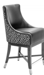
CNL-100-24SH SLOT STOOL

optional metal ball casters available on aluminum chair frame