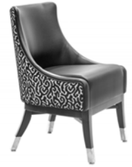
CNL-100 TABLE GAMES CHAIR

Seat Height: 27.0 in Seat Width: 18.0 in Seat Depth: 18.0 in Overall Height: 41.5 in Overall Width: 22.0 in Overall Depth: 24.0 in