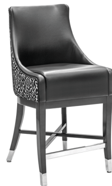
TABLE GAMES STOOL CNL-100-27SH

Hardwood Base (maple) Optional Metal Base Available