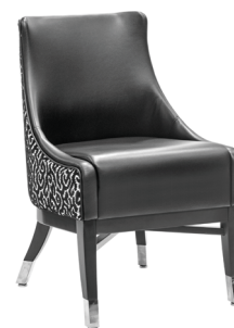
TABLE GAMES CHAIR CNL-100

Hardwood Base (maple) Optional Metal Base Available