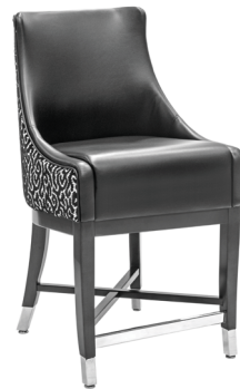
SLOT STOOL CNL-100-24SH

Seat Height: 24.0 in Seat Width: 18.0 in Seat Depth: 18.0 in Overall Height: 38.3 in Overall Width: 22.0 in Overall Depth: 24.0 in