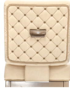
SEWN TACK TUFTING