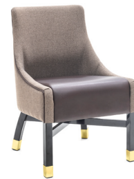
DINING CHAIR (Optional Aluminum Base) CNL-100-M

Seat Height: 30.5 in Seat Width: 18.0 in Seat Depth: 18.0 in Overall Height: 44.5 in Overall Width: 22.0 in Overall Depth: 24.0 in