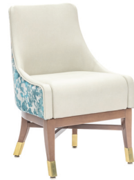
DINING CHAIR CNL-100

Seat Height: 19.0 in Seat Width: 18.0 in Seat Depth: 18.0 in Overall Height: 33.3 in Overall Width: 22.0 in Overall Depth: 24.0 in