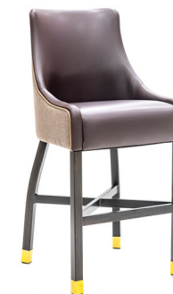
BARSTOOL (Optional Aluminum Base) CNL-100-M-B

Seat Height: 19.0 in Seat Width: 18.0 in Seat Depth: 18.0 in Overall Height: 33.3 in Overall Width: 22.0 in Overall Depth: 24.0 in