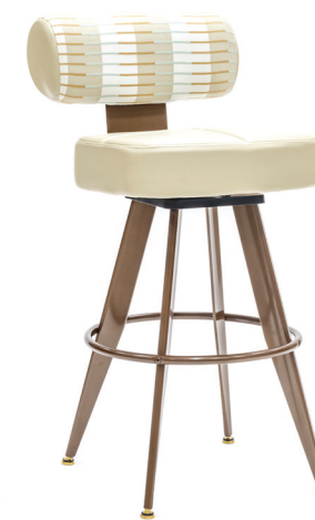
BARREL BACK GIB-100