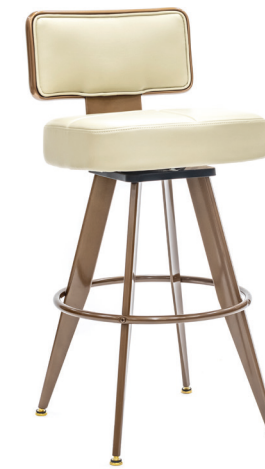
FLAT BACK GIB-101