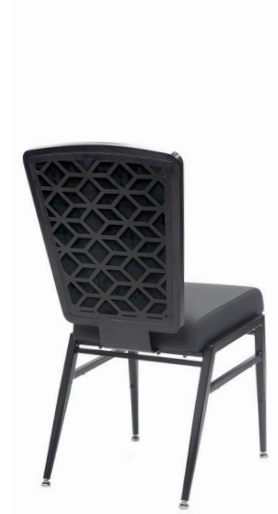
TAPERED BACK WITH LATTICE IDO-105