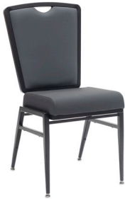
STACKABLE BANQUET CHAIR IDO-104

Seat Height: 19.0 in Seat Width: 15.5 in Seat Depth: 17.8 in Overall Height: 37.0 in Overall Width: 17.9 in Overall Depth: 23.0 in