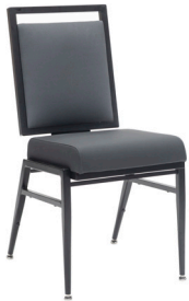
STACKABLE BANQUET CHAIR IDO-102

Seat Height: 19.0 in Seat Width: 15.5 in Seat Depth: 17.8 in Overall Height: 35.0 in Overall Width: 17.5 in Overall Depth: 23.5 in