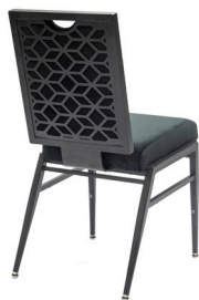
STACKABLE BANQUET CHAIR IDO-103

Seat Height: 19.0 in Seat Width: 15.5 in Seat Depth: 17.8 in Overall Height: 35.0 in Overall Width: 17.5 in Overall Depth: 23.5 in