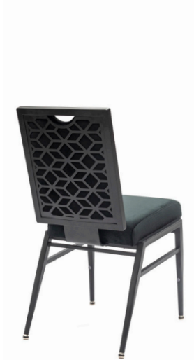
STRAIGHT BACK WITH LATTICE IDO-103