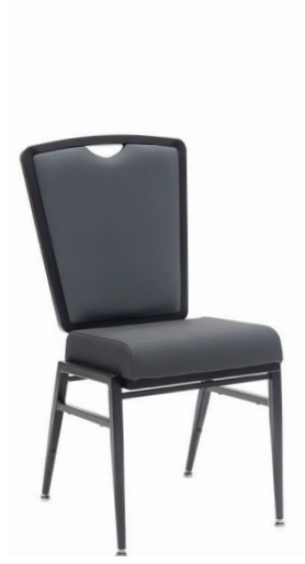
TAPERED BACK IDO-104