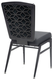
STACKABLE BANQUET CHAIR IDO-105

Seat Height: 19.0 in Seat Width: 15.5 in Seat Depth: 17.8 in Overall Height: 37.0 in Overall Width: 17.9 in Overall Depth: 23.0 in