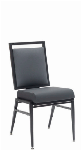
STRAIGHT BACK IDO-102