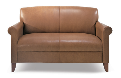
MAX-200 APPROXIMATE DIMENSIONS