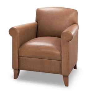
MAX-100 APPROXIMATE DIMENSIONS