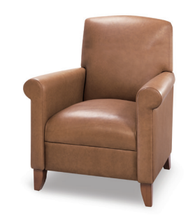
MAX-101 APPROXIMATE DIMENSIONS