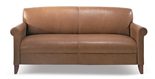
MAX-300 APPROXIMATE DIMENSIONS