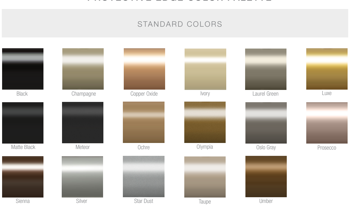
CUSTOM COLORS AVAILABLE Note: All colors illustrated here are made by the lithographic process and may vary from actual product colors.