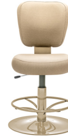
QTM-100-158-PASH FULL SEAT WIDTH SLOT STOOL

Approximate Dimensions: Seat Height: 20.5 - 25.0 in Seat Width: 20.0 in Seat Depth: 18.0 in Overall Height: 37.5 - 42.0 in Overall Width: 22.0 in Overall Depth: 25.5 in