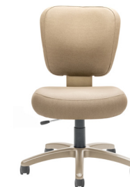
QTM-100-5V-PASH FULL SEAT WIDTH POKER CHAIR

Approximate Dimensions: Seat Height: 27.0 in Seat Width: 17.0 in Seat Depth: 18.0 in Overall Height: 44.0 in Overall Width: 17.0 in Overall Depth: 25.5 in