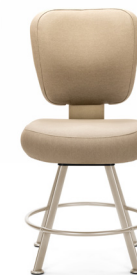
QTM-100-113 FULL SEAT WIDTH SLOT STOOL

Approximate Dimensions: Seat Height: 20.5 - 25.0 in Seat Width: 20.0 in Seat Depth: 18.0 in Overall Height: 37.5 - 42.0 in Overall Width: 22.0 in Overall Depth: 25.5 in