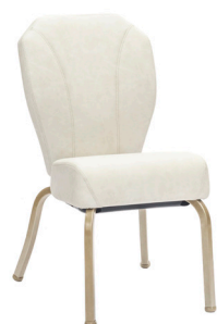
STACKABLE DINING CHAIR NPT-104

Seat Height: 19.0 in Seat Width: 17.5 in Seat Depth: 17.0 in Overall Height: 35.5 in Overall Width: 20.0 in Overall Depth: 26.5 in