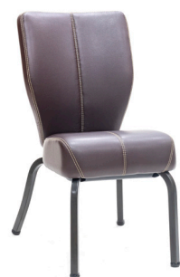
STACKABLE DINING CHAIR NPT-100

Seat Height: 19.0 in Seat Width: 17.5 in Seat Depth: 17.0 in Overall Height: 35.5 in Overall Width: 20.0 in Overall Depth: 26.5 in