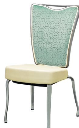
KLS-105 Shown with optional Integrated Handle* *Not available on all models