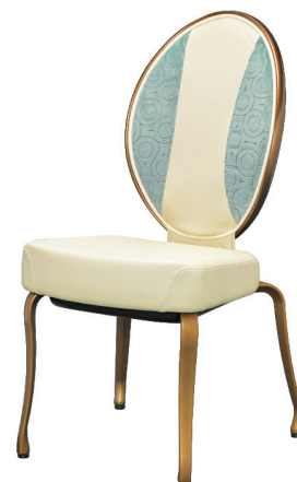
KLS-102 Shown with optional Accent Upholstery