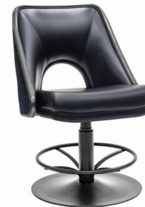
CUTOUT BACK CHN-101