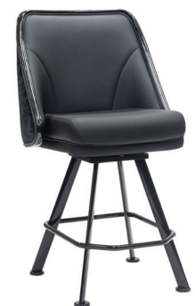
TABLE GAMES STOOL CHN-202-133

Seat Height: 24.0 in Seat Width: 20.0 in Seat Depth: 18.0 in Overall Height: 38.5 in Overall Width: 22.5 in Overall Depth: 24.3 in