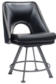
SLOT STOOL CHN-101-113

Seat Height: 20.5 - 25.0 in Seat Width: 20.0 in Seat Depth: 19.5 in Overall Height: 36.0 - 40.5 in Overall Width: 23.8 in Overall Depth: 25.5 in