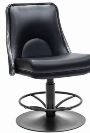
RECESSED BACK CHN-100