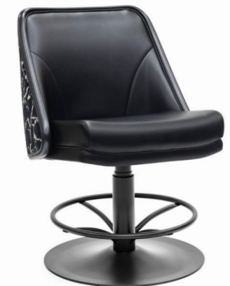
WRAPAROUND BACK CHN-102