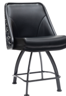
SLOT STOOL CHN-102-181

Seat Height: 20.5 - 25.0 in Seat Width: 20.0 in Seat Depth: 18.0 in Overall Height: 35.0 - 39.5 in Overall Width: 22.0 in Overall Depth: 24.3 in