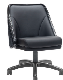
POKER CHAIR CHN-202-5V1-PASH

Seat Height: 27.0 in Seat Width: 18.0 in ( reduced ) Seat Depth: 18.0 in Overall Height: 41.5 in Overall Width: 22.5 in Overall Depth: 24.3 in