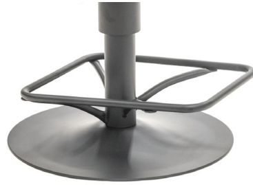
Shown with Optional Column Cover

Additional base designs and custom base options are available. All bases options may not fit all models.