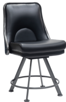
SLOT STOOL CHN-100-113

Seat Height: 20.5 - 25.0 in Seat Width: 20.0 in Seat Depth: 19.0 in Overall Height: 36.5 - 41.0 in Overall Width: 22.0 in Overall Depth: 24.3 in