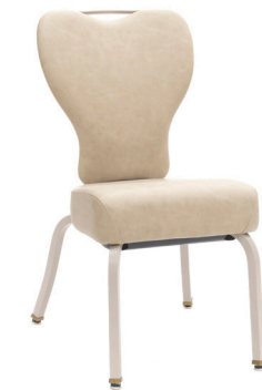
HOURLASS BACK SLA-104