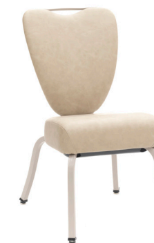
SHIELD BACK SLA-102