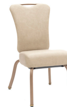
RECTANGULAR BACK SLA-101