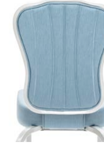
CHANNEL SEWN TUFTING

Hand-pleated tufting with deep foam padding on the inside or outside of backrest