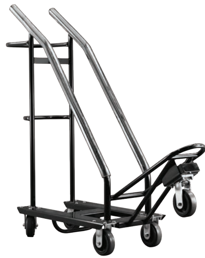
HEAVY DUTY HAND TRUCK

Gasser Standard Hand Trucks are constructed with a welded assembly of heavy gauge steel tube protected with a durable Powder Coat finish.