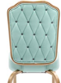
SEWN, TACK TUFTING

Additional panels with accenting upholstery sewn into backrest