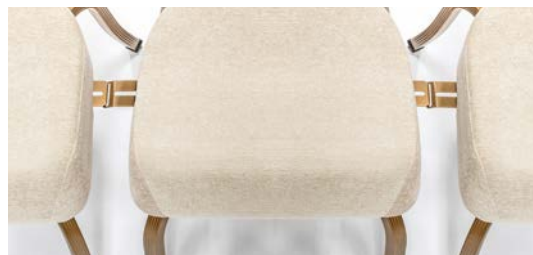
RETRACTABLE GANGING BRACKET (GB-2)

All ganging brackets may not fit all models