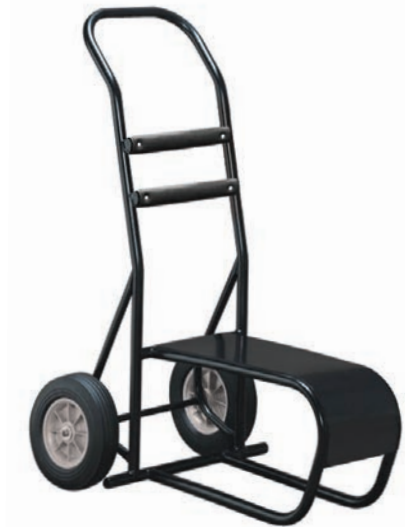
STANDARD HAND TRUCK

Gasser Standard Hand Trucks are constructed with a welded assembly of heavy gauge steel tube protected with a durable Powder Coat finish.