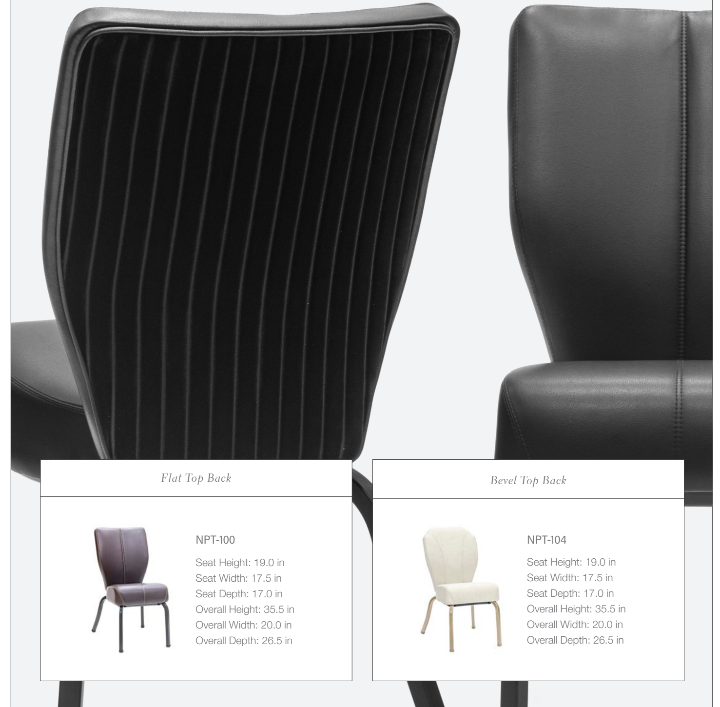
Flat Top Back