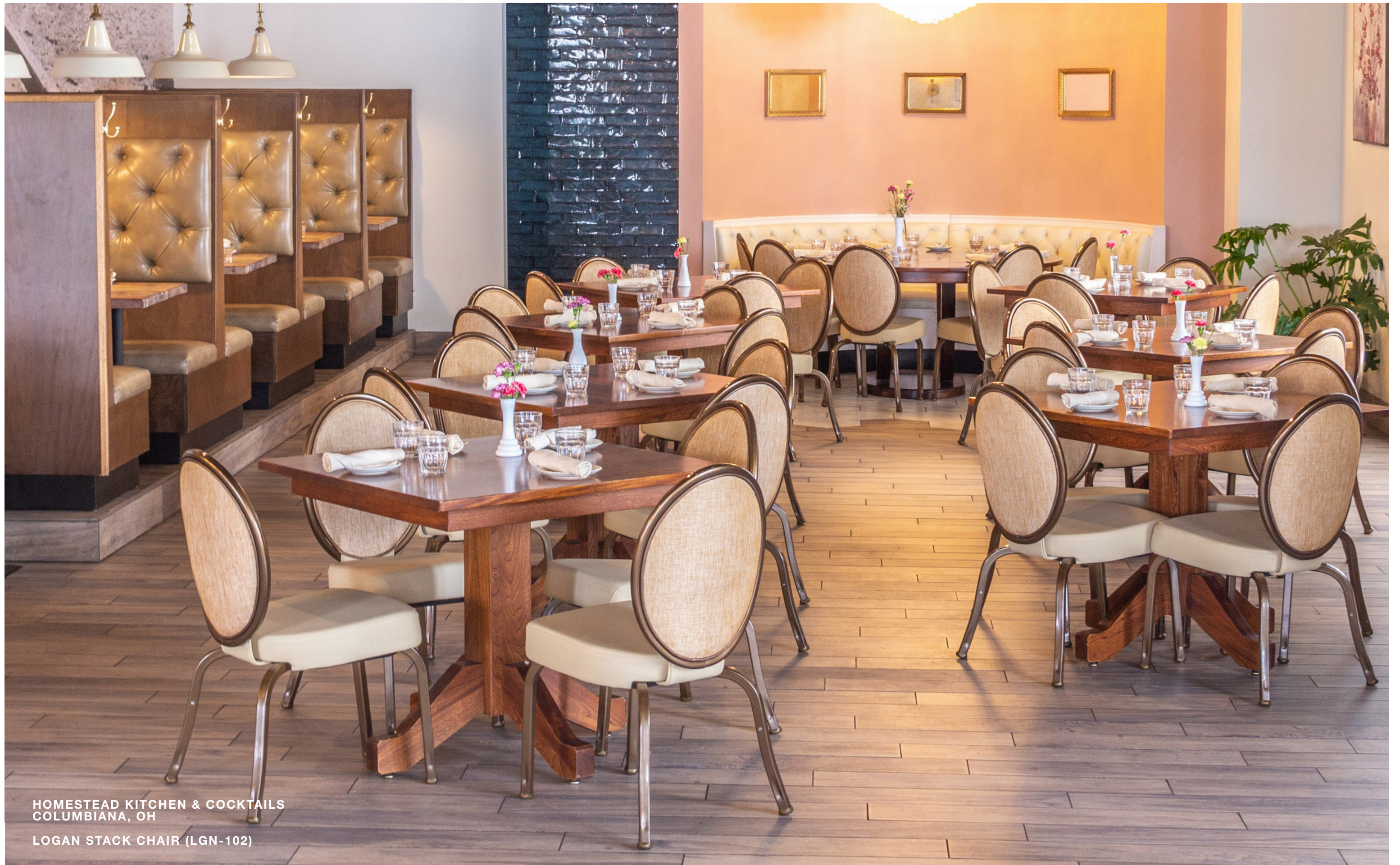
HOMESTEAD KITCHEN & COCKTAILS COLUMBIANA, OH LOGAN STACK CHAIR (LGN-102)