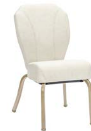
Bevel Top Back

Seat Height: 19.0 in Seat Width: 17.5 in Seat Depth: 17.0 in Overall Height: 35.5 in Overall Width: 20.0 in Overall Depth: 26.5 in