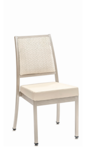
SQUARE BACK GTE-103