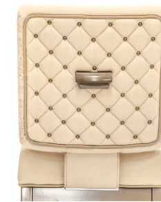
SEWN TACK TUFTING