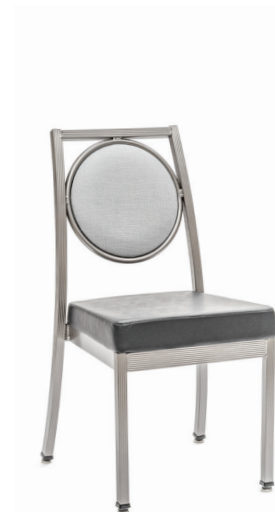
ROUND BACK GTW-101