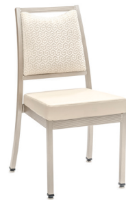
STACKABLE BANQUET CHAIR GTW-103

Seat Height: 19.0 in Seat Width: 17.0 in Seat Depth: 18.0 in Overall Height: 36.0 in Overall Width: 19.5 in Overall Depth: 24.5 in