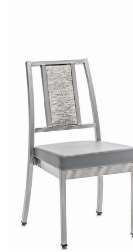
RECTANGULAR BACK GTW-102