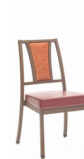
TAPERED BACK GTW-101