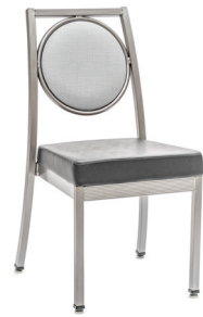
STACKABLE BANQUET CHAIR GTW-100

Seat Height: 19.0 in Seat Width: 17.0 in Seat Depth: 18.0 in Overall Height: 36.0 in Overall Width: 19.5 in Overall Depth: 24.5 in