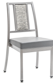
STACKABLE BANQUET CHAIR GTW-102

Seat Height: 19.0 in Seat Width: 17.0 in Seat Depth: 18.0 in Overall Height: 36.0 in Overall Width: 19.5 in Overall Depth: 24.5 in