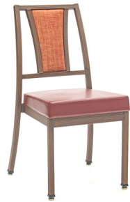
STACKABLE BANQUET CHAIR GTW-101

Seat Height: 19.0 in Seat Width: 17.0 in Seat Depth: 18.0 in Overall Height: 36.0 in Overall Width: 19.5 in Overall Depth: 24.5 in