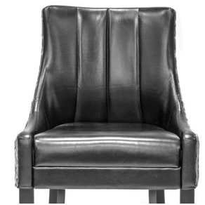
CHANNEL SEWN TUFTING