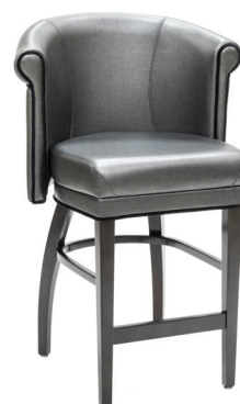
TABLE GAMES STOOL CMB-100-27SH

Seat Height: 24.0 in Seat Width: 18.0 in Seat Depth: 18.0 in Overall Height: 40.5 in Overall Width: 27.5 in Overall Depth: 23.0 in