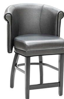
SLOT STOOL CMB-100-24SH

Seat Height: 24.0 in Seat Width: 18.0 in Seat Depth: 18.0 in Overall Height: 40.5 in Overall Width: 27.5 in Overall Depth: 23.0 in